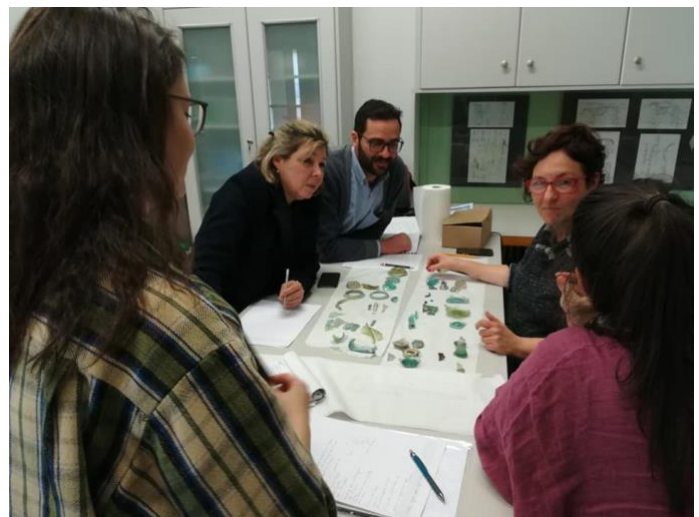
Objects handling session at the short course.

Artemios took part in a short course, entitled 'Glass in the Mediterranean and the Near East', which was organised by the Fitch Laboratory, the British School at Athens (Greece), last April. Sadly, this year's course has been postponed; but in case you are keen to learn more about the analysis of glass and vitreous materials from the field's leading specialists, you may wish to consider Artemios' recommendation: https://socarchsci.blogspot.com/2020/04/short-course-review-glass-in.html