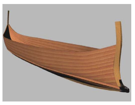
Figure 2. Render of the partially reconstructed Egadi 10 warship with a three-dimensional scan of the Egadi 10 ram.

This research represents a small fraction of the work conducted on the Battle of the Egadi Islands Site. The partial reconstruction of the Egadi 10 warship sets out to develop potential hypotheses of the ships construction to aid in further research of the warships that sank during the battle in 241 B.C. Further analysis into the social, political, and economic factors will aid in the study of the various constraints that affected the development and construction of these warships.