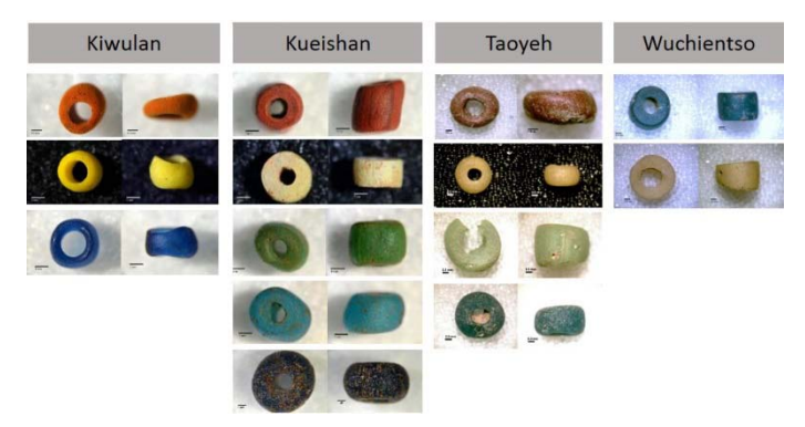
Figure 2. Some examples of glass beads from Kiwulan, Kueishan, Taoyeh and Wuchientso.

glass from the four sites: m-Na-Al glass and plant ash glass (Table 1). I was observed that all the samples generally contain more than 14% soda, which indicates the use of soda as a flux in glass production. Samples with a concentration of MgO higher than 3% are soda plant ash glass, while those with MgO lower than 1% and Al_2O_3 higher than 8% are m-Na-Al glass. The two types of glass composition suggest different sources of soda flux: plant ash glass from vegetal sources and m-Na-Al glass from mineral sources.