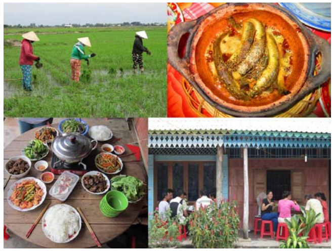
Figure 3. A glimpse into the present-day Southern Vietnamese foodways. Upper left: Women farmers planting rice. Upper right: Cá kho tộ (braised fish in caramel) is cooked and served in an earthenware pot. Lower left: Hotpot meal to be served to the excavation team. Lower right: Members of the excavation team enjoying the last lunch served by the hosting family living near the site.

I gained several advantages by participating in this fieldwork. First, I had an opportunity to undertake "on site" selection and collection of unwashed pottery samples, which have a higher probability of yielding organic residues compared to washed samples. Second, I gained direct knowledge on the provenience of my samples by helping out with the processing and curating of the materials, frequently visiting the trenches, and familiarizing myself with the systematic and efficient system. Third, my interactions recording with archaeobotanists and zooarchaeologists provided me with access to direct knowledge of the faunal and floral specimens being recovered from the excavations that I can compare to my residue analysis results. Fourth, this knowledge helped me to modify my sampling strategy of important plant and animal food species from southern Vietnam and Southeast Asia for building a reference collection. Finally, I was able to observe and experience the present-day foodway practices of the people living in southern Vietnam (fig. 3). These include rice planting, a preference for preparing and serving fish dishes in earthenware pottery, and household scale production of fish sauce in large stoneware jars. The research team got to enjoy numerous simple and sumptuous meals.