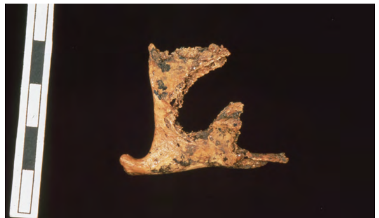
Figure 1. Ossified thyroid cartilage recovered with the skeletal remains from an adult male at the Sully Site.

So, is any spherical, hallow, calcified structure a hydatid cyst (Figure 1)? No, not necessarily. Dystrophic calcification of necrotic tissue may result in calcification with a similar appearance from a variety of causes. Around the periphery, the blood supply is cut off due to vascular obstruction (Ortner and Putschar 1981). Consequently, the central necrotic mass