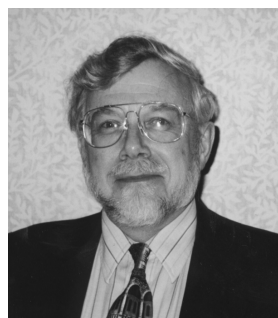
Archaeological Ceramics Charles C. Kolb, Associate Editor

The column in this issue includes eight topics: 1) News; 2) Reviews of Books on Archaeological Ceramics; 3) New Publications; 4) FAMSI Website; 5) Previous Meetings; 6) Forthcoming Meetings; 7) Exhibits; and 8) Internet Resources.