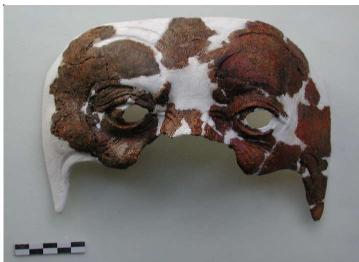
Face mask found in Str M7-22, Aguateca, Guatemala

Conservation. The large deposits from the royal residence at Aguateca received conservation attention both in the field and subsequently in the laboratory (Beaubien 2003a). After careful cleaning in situ , any contiguous fragments were lifted together by applying facing tissues with a temporary adhesive. Later in the laboratory, after numerous tests, the fragments were carefully cleaned to remove accretions, and completely consolidated so that they could be handled during the reassembly process. A more complete reconstruction was possible in the case of the face mask,