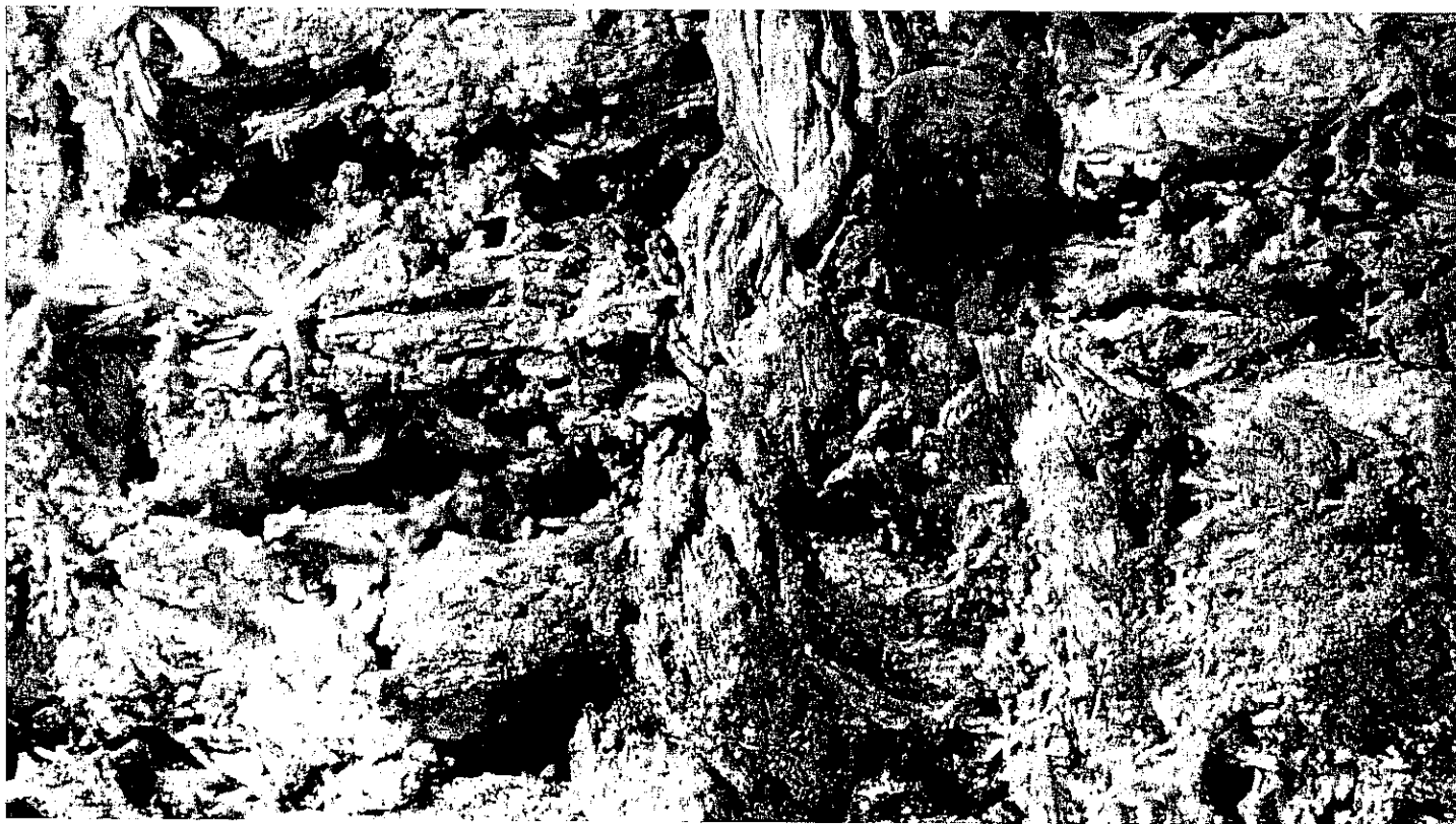
Figure 2 Pseudomorph after twined fabric from Tunacunnee, Georgia, ca. 200 A.D.