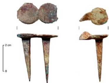
Figure 3. Sheathing tacks, with no signs of use: a pair of tacks, as they were extracted from the mold (left), and a tack with remains of the sprue (right).

In addition to ammunition, almost ten kilos of sheathing tacks were recovered from the stern area of the ship's hold, abaft the mizzen mast. Most of these exhibit traces of the manufacturing process (e.g. burrs and remnants of a sprue on the head perimeter, which indicate they were made by serial casting), and have no signs of being used (fig. 3). They could have been intended to carry out minor repairs on the vessel itself or other ships that were part of the expedition.