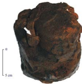
Figure 2. An 18-pound canister shot (diameter: ca. 130 mm), filled with different sized balls and a square shank nail (arrow).

(langrage shot). Evidence for the latter, a practice supposedly exclusive to privateers and merchantmen, was found at the site (fig. 2).