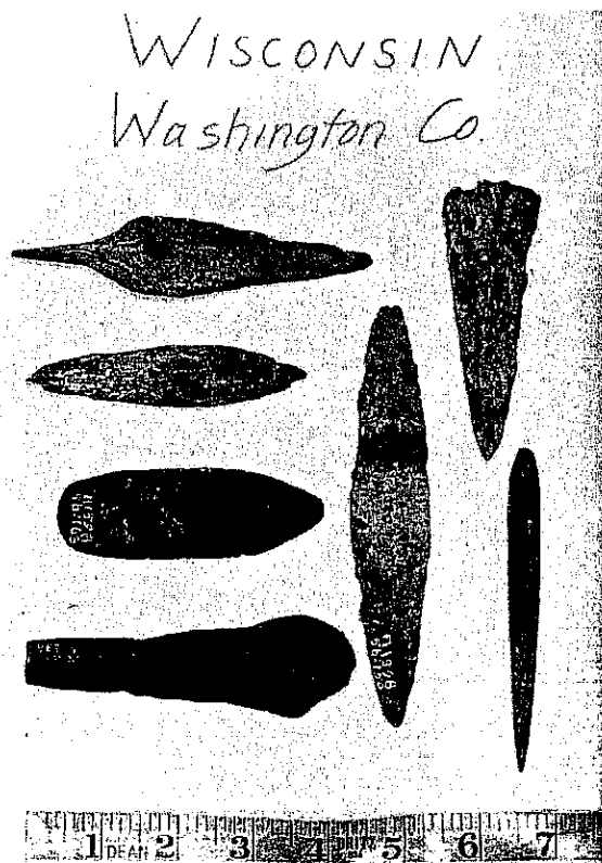
Native copper artifacts examined by Archaeometry Laboratory.