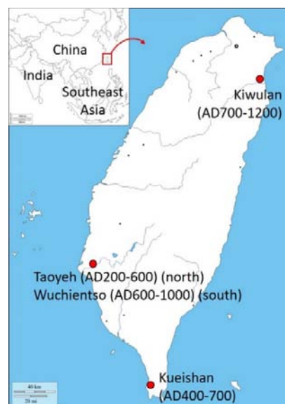
Figure 1. Map showing the location and chronology of Kiwulan, Taoyeh, Wuchientso and Kueishan sites in Taiwan.

A project to explore the movement of glass beads and to investigate the potential provenance of beads found in Taiwan was initiated in 2012. This research examines beads from a variety of sites in Taiwan dating from the 3 rd century BC to the 12 th century AD and studies both bead context, typology and chemistry in order provide a more holistic picture of bead provenance and movement. In the field session from March to early June 2015, with the aid of funds from SAS, SEM-EDS and EPMA was conducted on glass beads from four Iron Age sites in Taiwan: Kiwulan (AD700-1200) in northeastern Taiwan, Kueishan (AD400-700) in southern Taiwan and Taoyeh (AD200-600) and Wuchientso (AD600-1000) in southwestern Taiwan (fig. 1). These sites cover a wide geographic range and a continuous chronological sequence in the 1 st millennium AD.