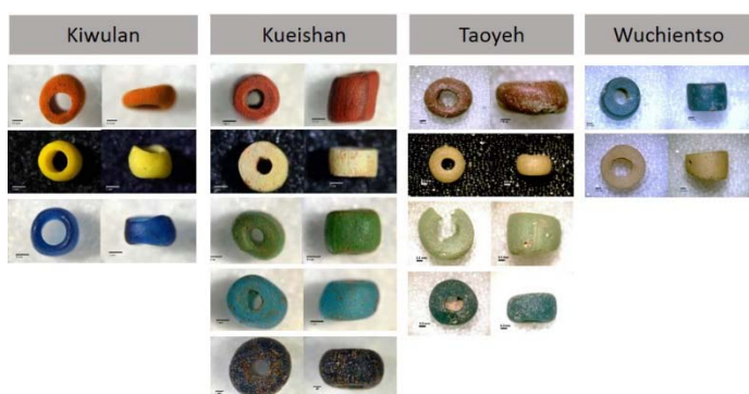
Figure 2. Some examples of glass beads from Kiwulan, Kueishan, Taoyeh and Wuchientso.

glass from the four sites: m-Na-Al glass and plant ash glass (Table 1). It was observed that all the samples generally contain more than 14% soda, which indicates the use of soda as a flux in glass production. Samples with a concentration of MgO higher than 3% are soda plant ash glass, while those with MgO lower than 1% and Al_2O_3 higher than 8% are m-Na-Al glass. The two types of glass composition suggest different sources of soda flux: plant ash glass from vegetal sources and m-Na-Al glass from mineral sources.